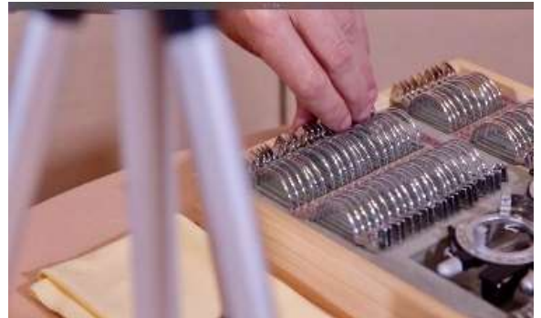
Close up of supplied trial lens case