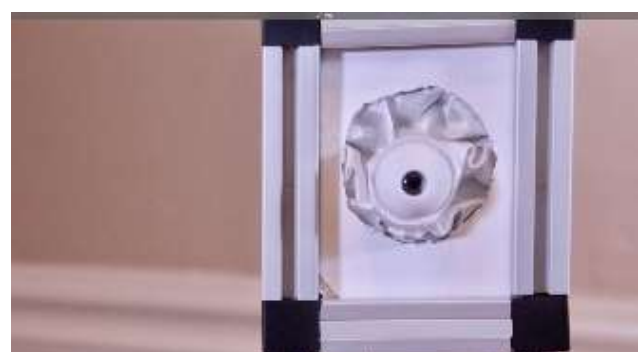
BIObot simulated eye closeup