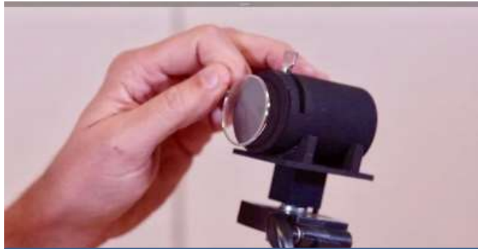
A close up of the retinoscopy model eye