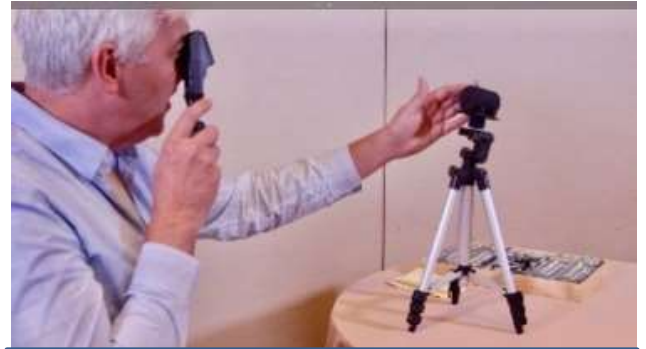
Retinoscopy model eye in action