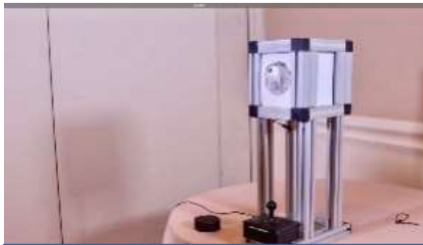
OEBC's proprietary BIObot