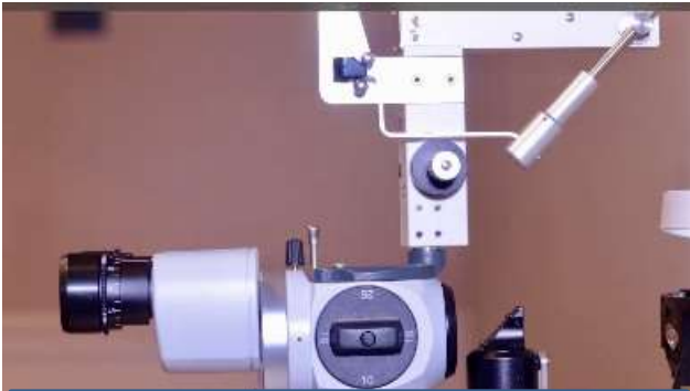
Close up of slit lamp mounted Goldmann tonometer.